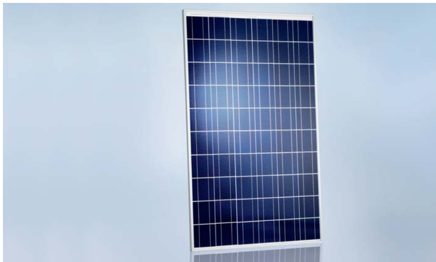
SCHOTT POLY™ 220/225/230/235

SCHOTT Solar has been a leading global developer and manufacturer of solar products for over 52 years. Engineered in Germany and manufactured in America, the high quality SCHOTT Solar PV modules are extremely durable and reliable as demonstrated in several important ways: